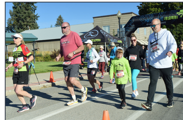
Runners of all ages enjoyed the annual Newport Autumn Bloom 5K / 10K Run.