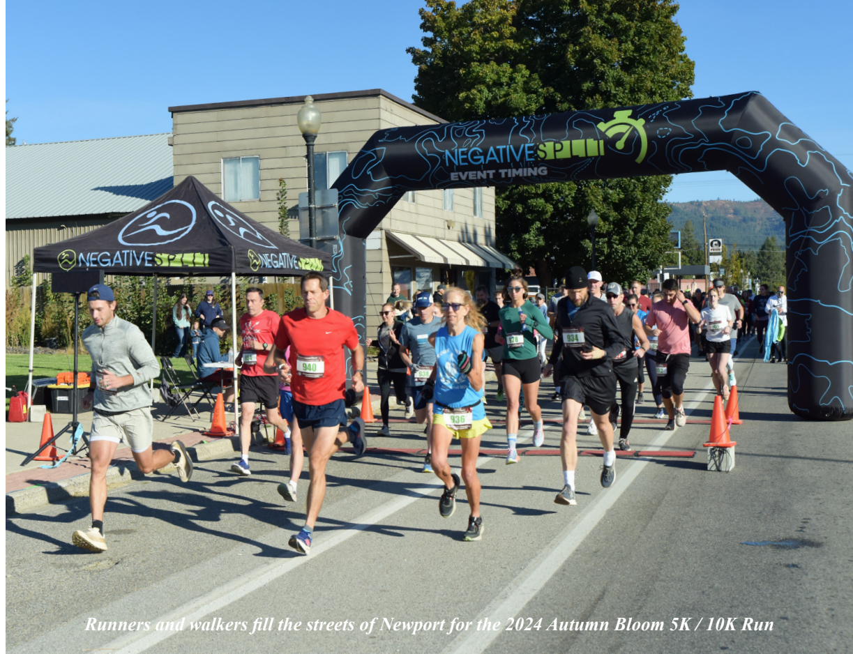
Runners and walkers fill the streets of Newport for the 2024 Autumn Bloom 5K / 10K Run

Making a difference in our community... with your help!