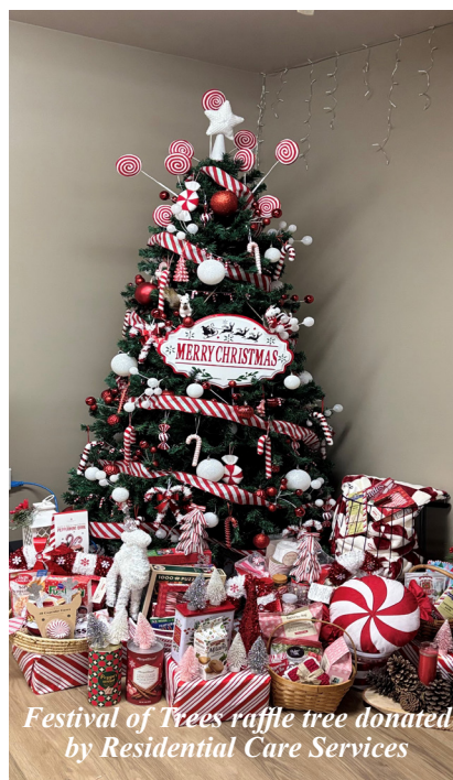
Festival of Trees raffle tree donated by Residential Care Services