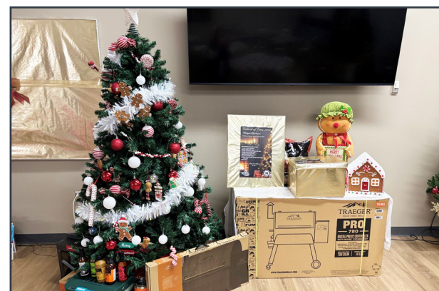
Festival of Trees raffle tree donated by Kalispel Tribe of Indians and Kalispel Casino