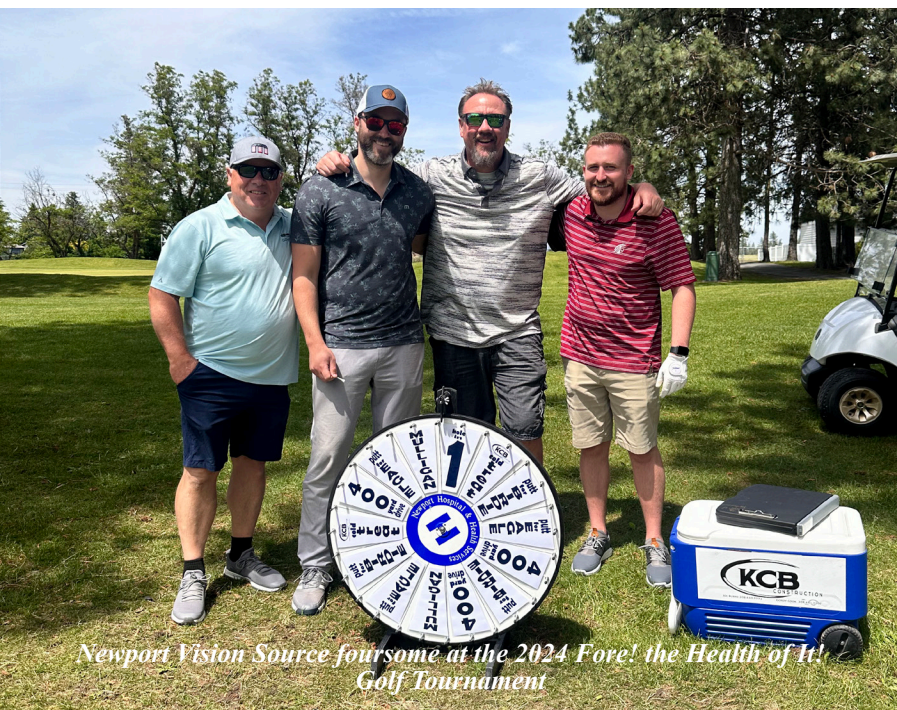
Newport Vision Source foursome at the 2024 Fore! the Health of It! Golf Tournament