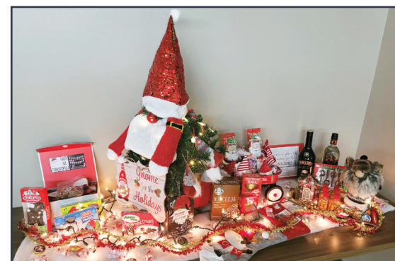
The popular Mini Tree Silent Auction was back for the second year. "Gnome for the Holidays" was sponsored by the Emergency department and voted "NHHS Fan Favorite" in 2023.