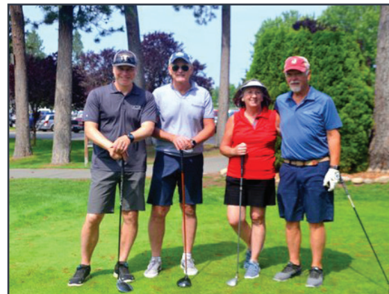
A foursome poses for a team photo at this year's Fore! the Health of It Golf Tournament.