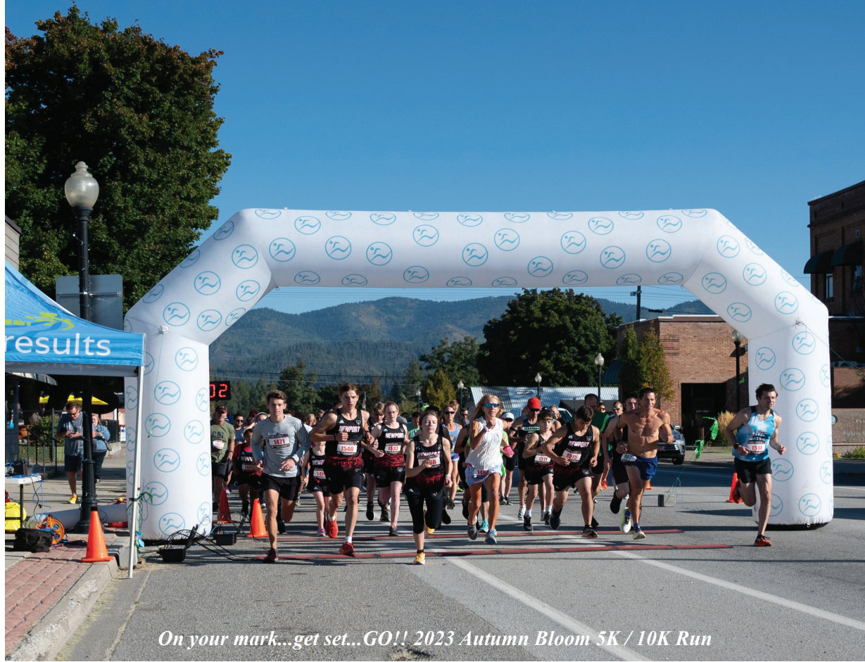
On your mark...get set...GO!! 2023 Autumn Bloom 5K / 10K Run

Making a difference in our community... with your help!