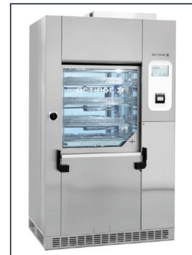
The new Getinge 86-series sterile processing washer allows the Surgery Department to sterilize more surgical instruments faster.