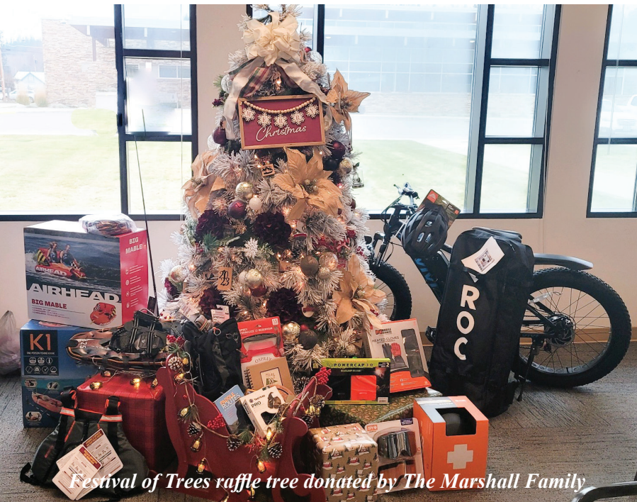
Festival of Trees raffle tree donated by The Marshall Family