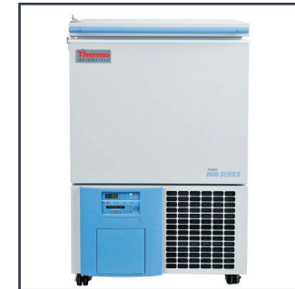
Allograft Freezer for Orthopedic Surgeries