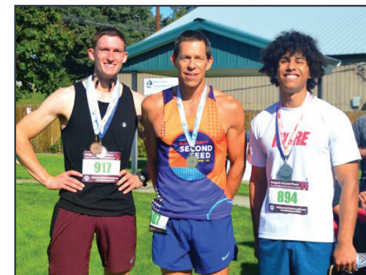
10K Overall Winners (Male) in this year's Autumn Bloom 5K / 10K Run.